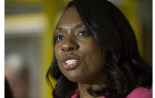
Ontario Education Minister Mazie Hinton should stop all streaming of kids into academic- and applied-level classes in Grades 9 and 10.