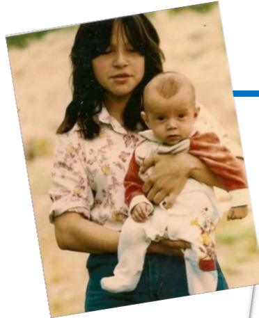
Pregnant at the age of 13!